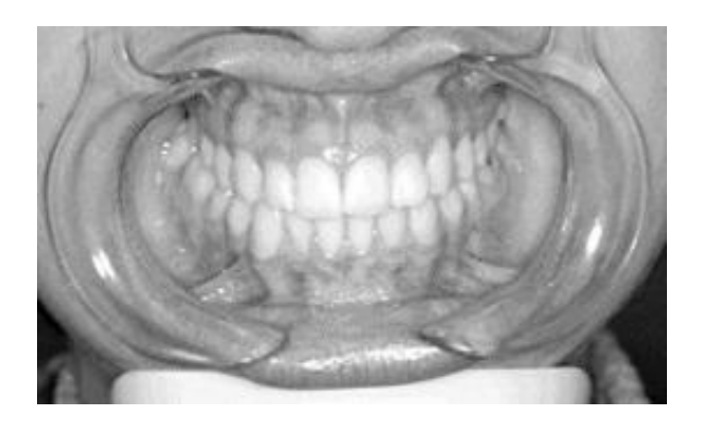
Fig. 1: The patient uses a plastic retractor before scanning

It also facilitates positioning of implant in different locations especially in immediate implant placement [1,5]. A thick tissue biotype plays a significant role in outcome of periodontal therapy [6,7] such as root coverage procedures [6,8,9]. Hence, measuring the thickness of soft tissue and the underlying bone before implant placement is beneficial to prevent complications such as soft tissue recession, implant exposure and consequent psychological problems [1,10]. When required, augmentation can be considered to achieve adequate contours [11].