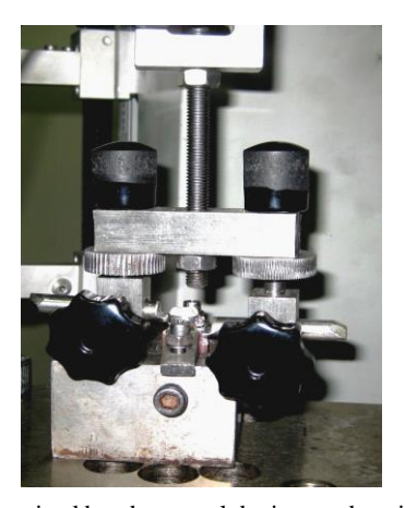
Fig. 2: Customized band removal device used to simulate clinical load for measurement of retentive strength

Each tooth was mounted in a special jig and was clamped to a customized holding device, which was designed by the authors and fixed to the lower load cell of the universal testing machine (Fig. 1). The arrowheads of the holding device were engaged fully under the buccal tube and lingual sheath of each band (Fig. 2). This configuration allowed all forces to be directed parallel to the long axis of the tooth during debonding.