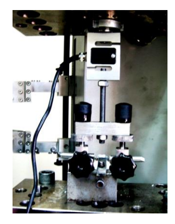
Fig. 1: Mounted tooth clamped to a customized holding device fixed to the lower load cell of the universal testing machine

Group 2: Bands were cemented to the teeth surfaces with ACP-containing GIC. Amorphous calcium phosphate was synthesized as follows: 46.3g of Ca(NO3)2, 4H2O was dissolved in 550mL of deionized water containing 40mL of 28 wt% ammonia. The solution was rapidly added to 27.2g of ammonium phosphate solution [(NH4)2HPO4 dissolved in 1300mL of deionized water containing 40mL of 28 wt% ammonia solution].