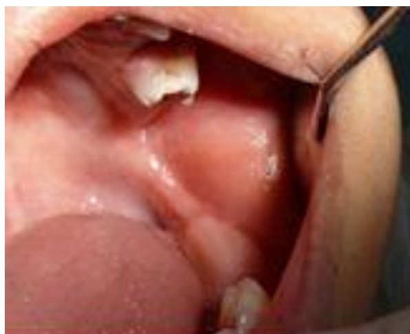
Fig. 3: Pterygomandibular triangle: the visible lower tip was considered as the correct point of needle insertion

perform local anesthesia using visual method to determine the point of needle insertion, the child was requested to open his/her mouth as much as possible.