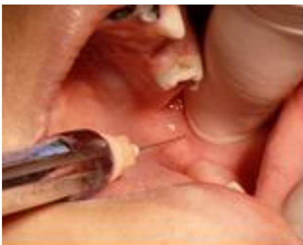
Fig. 2: Performing IANB using tactile method to find needle insertion point