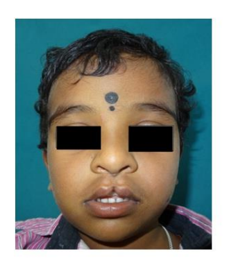
Fig. 1: Median cleft of the upper lip

The cleft was repaired using a Pfeifer incision. The highest- (points A, A'), and the deepestpoints (points B, B') of the white roll were marked on both sides. Subsequently, a wavy incision line was made starting from the deepest point and extending over the philtrum just above the cleft (Fig. 2). A diamond incision was made over the vermilion and the labial mucosa, intraorally extending just beyond the cleft margin. Incision was made and the mucosal tissue covering the area medial to the incision site (sterile zone) was removed. Undermining of the orbicularis oris muscle was performed and it was approximated using 4-0 vicryl. Skin was closed in a straight line using 6-0 ethilon sutures. Postoperatively, the patient had a satisfactory result. The cupid's bow was properly aligned, with equal height on both sides (Fig. 3). Vermilion form was satisfactory and the fullness and continuity of the orbicularis oris were maintained.