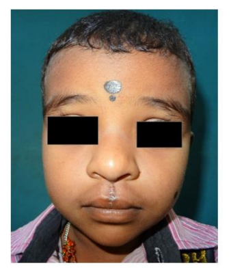
Fig. 3: Postoperative result after suture removal

Most patients with severe false clefts do not survive. False clefts are associated abnormalities of the forebrain are categorized under the category of holoprosencephaly [8,9]. In 1937, Veau [10] categorized median clefts to notch of the lip, median cleft extending to the columella, and defects due to atrophy of the midline facial structures. Median cleft face syndrome, frontonasal dysplasia, and Tessier 0 clefts are various terms used to describe abnormalities associated with true median clefts that are not accompanied by forebrain abnormalities [3]. The tessier 0 anomaly may present as a small notch in the soft tissue, or in association with hypertelorism, midline craniofacial osseous defects, and hairline abnormalities. The majority of cases are sporadic, but familial cases have also been documented [11]. Severe cases require reconstruction of the nasal anatomy. Correction of hypertelorism is best delayed until the patient is eight years old.