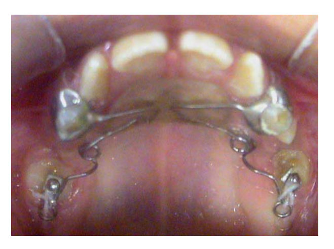
Fig 3. The view of fixed appliance used for distal movement of first molars.

spectively. At the end of treatment the right side angle increased to 100° and the left to 97°, indicating a 67° correction in right side and 60° on the left (Fig 1 and 2). Total duration of treatment was 16 months and treatment result was satisfactory.