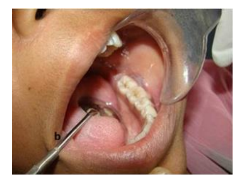
Fig. 1: Grayish-white patch with striations seen on (a) right gingiva and vestibule and (b) left gingiva and vestibule

There was no history of recent change in toothpaste, use of mouthwashes or fluoride application. No history of change in food habits in the past was elicited. The patient had not undergone any kind of treatment. The patient did not report any pruritus, skin eruptions, burning micturition, eye lesions or joint pains. No history medication usage or previous hospitalization was documented. There was no contributory medical or family history. The patient had not undergone any dental procedure in the past. There was no evidence of lesions on dermatological examination. No obvious nail or scalp changes were evident. Cervical lymph nodes were non-palpable. On intraoral examination, the patient's oral hygiene was fair. Dental examination showed no decayed or restored teeth. Soft tissue examination revealed presence of irregular 2×2cm grayish white patches with peripherally radiating white striae on the gingiva and vestibular area of the permanent mandibular molars bilaterally (Fig. 1). These patches were non-scrapable, non-tender and non-indurated.