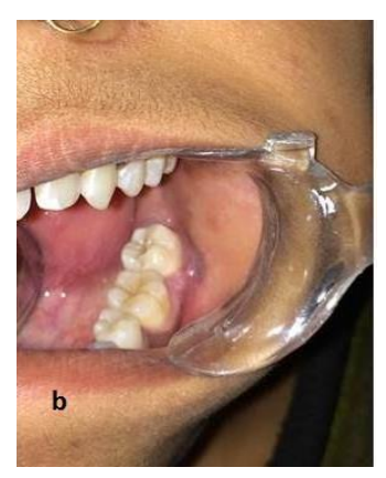
Fig. 3: Post-treatment, healed lesions observed in (a) right gingiva and vestibule and (b) left gingiva and vestibule

Oral prophylaxis was done and the patient was placed on chlorohexidine mouth rinse. Initially, 0.2% topical steroid (triamcinolone acetonide) was prescribed for the patient for two weeks along with topical antifungals (1% clotrimazole). However, after two weeks, the patient was still symptomatic with no visible improvement. Thus, all the medications were suspended and 0.05% topical tretinoin was prescribed to be applied twice a day for two weeks. The patient showed a remarkable improvement in symptoms and clinical appearance. However, considering the adverse effects of retinoids in case of long-term use in a pediatric patient, retinoids were suspended and the patient was subsequently advised to use aloe vera gel topically twice a day for one month.