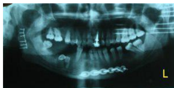
Fig. 4: Postoperative panoramic view

The advantages and disadvantages of various approaches used for management of subcondylar fractures have been previously evaluated [5]. Closed reduction with intermaxillary fixation is a non-invasive approach widely used to treat condylar and subcondylar fractures. It poses a minor danger to the facial nerve and leaves no scars. Some complications may arise in closed reduction such as inappropriate vertical high that may lead to malocclusion, improper anatomical reduction, and weight loss because of intermaxillary fixation. Another issue is the duration of maxillomandibular fixation; it may vary from 2 to 6 weeks (a two-week rigid fixation followed by elastic fixation in case of malocclusion). Surgeons prefer short fixation periods to avoid problems such as TMJ ankylosis. Trauma to the TMJ capsule can also induce TMJ ankylosis. This complication of the closed reduction approach compelled surgeons to seek new methods to treat fractures [5]. In the Shirani method, the surgeon makes an intraoral incision with a low risk of facial nerve damage and without any residual scars. Intraoral access to the fracture site by the Shirani method is more difficult compared to the extraoral approach. The advantages of this new method over the closed reduction include direct access to the fracture site, improved alignment of the fractured bones, satisfactory mandibular and TMJ function, suitable postoperative occlusion and short-term maxillomandibular fixation.