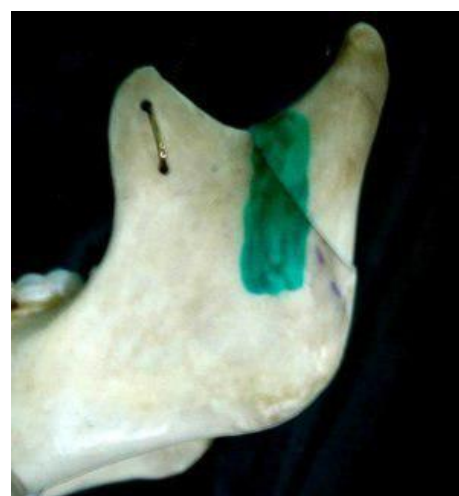
Fig. 2: Osteoreduction line in the Shirani method

A 30-year-old man with a subcondylar fracture due to a car accident was referred to the oral and maxillofacial surgery department of Tehran University of Medical Sciences. The panoramic radiograph supplemented with a posteroanterior (PA) mandibular view revealed a fracture line located under the neck of the left mandibular condylar process. The fractured bone had been laterally displacement due to the contraction of the temporalis muscle (Fig. 1).