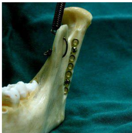
Fig. 3: Bone fixation with plate and screws in the Shirani method

In the operating room, an intraoral incision was made in the soft tissue similar to that performed in sagittal osteotomy (approximately 1cm above the dental occlusal surface, from the anterior aspect of the ramus to the mesial aspect of the second molar). After soft tissue dissection and accessing the fractured bone, a vertical step was created on the ramus body extending from the mandibular notch to the superior aspect of the angle of the mandible using an end cutting fissure bur (Fig. 2). After repositioning the fractured bone, a plate was secured in the rectangular-shaped step and was fixed by two screws (Fig. 3). Maxillomandibular rigid fixation was performed using the arch bar and wire for one week, followed by a two-week non-rigid fixation with elastics for occlusal adjustment. After 48 hours, panoramic and PA mandibular views were used to assess the results of the surgery. To ensure that the procedure has been properly done, mouth opening, occlusion, and TMJ function were assessed (Fig. 4). One-year follow-up showed no complications or canting, and the patient was satisfied with the results.