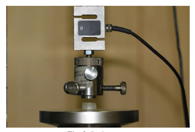
Fig. 3: Push-out test

The push-out test was performed by placing the specimens on a special acrylic jig inside a Universal Testing Machine (Zwick-Roell, Ulm, Germany; Fig. 3).