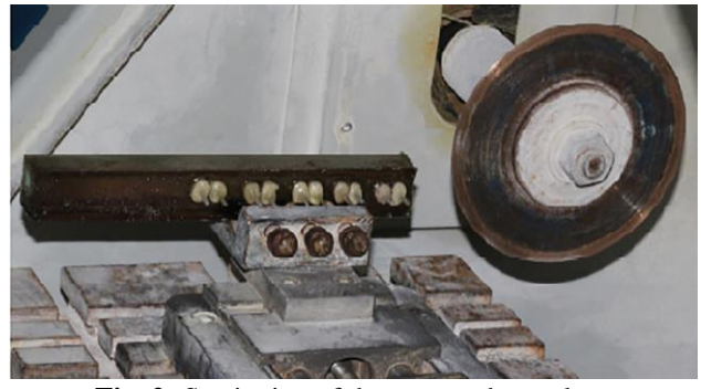
Fig. 2: Sectioning of the mounted samples

After setting, the resin block with the embedded roots was separated from the mold and placed in the cutting machine (Fig. 2).