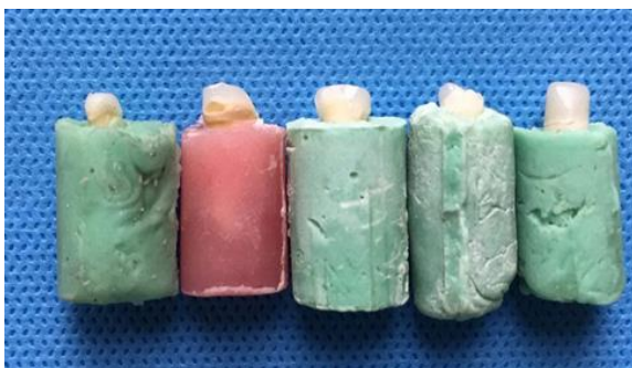
Fig. 4. Irreparable fracture (below the CEJ)