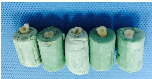
Fig. 3. Repairable fracture (above the CEJ)