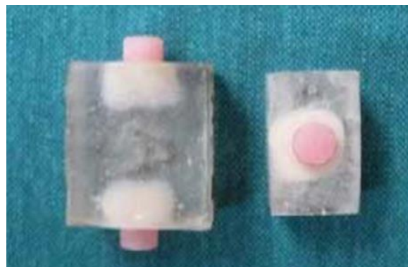
Fig. 2. Samples after removal from putty and cleaning

pressure (100 kg) for 10 minutes and then clamped and cured for eight hours at 74°C as recommended by the manufacturer [19]. After the flask cooled down, the samples were removed and cleaned. The excess acrylic resin was also removed (Fig. 2).