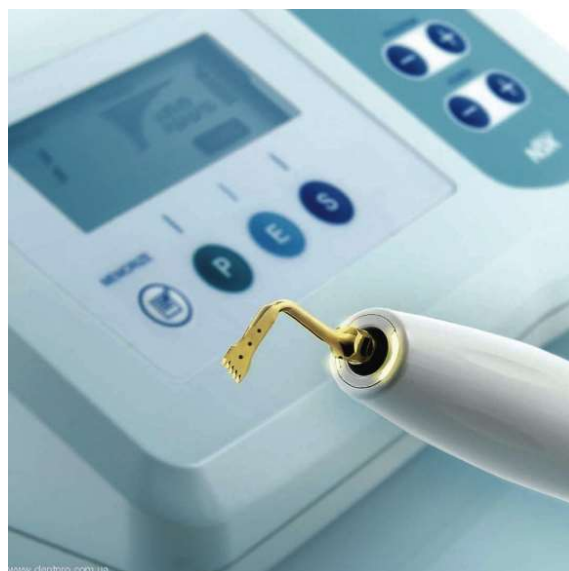
Fig. 1. Ultrasonic Bone Surgery System (VarioSurg, NSK, Tokyo, Japan)

The bonded brackets were incorporated into a stainless steel or nickel-titanium (Ni-Ti) wire, depending on the initial crowding, to start the orthodontic treatment. The teeth were maintained in the oral cavity for two months, and thereafter, they were extracted by a periodontist using the Ultrasonic Bone Surgery System (VarioSurg, NSK, Tokyo, Japan) to prevent bracket debonding during extraction (Fig. 1).