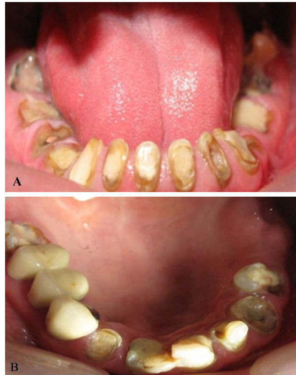
Fig. 1. (A): Intraoral view of the lower jaw. (B): Intraoral view of the upper jaw.