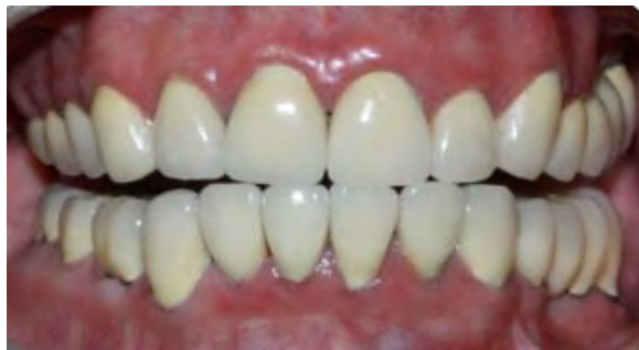
Fig. 7: Final restorations in protrusive position

Aesthetics and phonetics were verified. Also, lateral and protrusive movements and amount of disclusion were reviewed. An impression was taken from the prepared teeth, abutments, and temporary restoration, which was transferred to an articulator for cross-mount procedures. Final wax-up and cutback were performed. The putty index was used for the application of porcelain. Framework and porcelain adjustments were performed. The restorations were glazed and cemented. The VD and lateral movements were checked (Fig. 7).