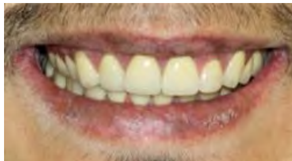
Fig. 8. After 9 months of follow-up

Oral hygiene instructions were emphasized, which included dental flossing after each meal, tooth brushing three times a day, daily use of 0.2% sodium fluoride (NaF) mouthwash, chewing sugar-free gum, use of saliva