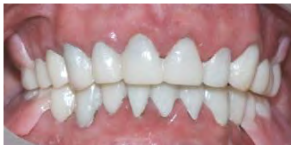
Fig. 3: Overlay prosthesis

After gingival plane determination, second wax-up was done on a duplicating cast to fabricate a surgical stent for crown lengthening surgery. An overlay denture was delivered for VD, phonetic, and aesthetic analyses as well as temporary function (Fig. 3)