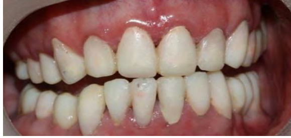
Fig. 6: Temporary restorations in protrusive position

Aesthetics and phonetics were verified. Also, lateral and protrusive movements and amount of disclusion were reviewed. An impression was taken from the prepared teeth, abutments, and temporary restoration, which was transferred to an articulator for cross-mount procedures. Final wax-up and cutback were performed. The putty index was used for the application of porcelain. Framework and porcelain adjustments were performed. The restorations were glazed and cemented. The VD and lateral movements were checked (Fig. 7).