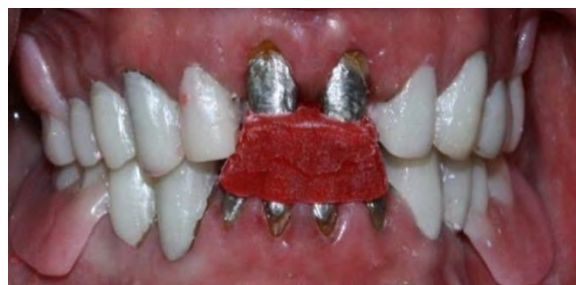
Fig. 5: Anterior segment of the overlay denture used for post fabrication

At first, chairside fixed temporary restorations were made, and after post cementation, the final lab-processed temporary restoration was delivered to the patient (Fig. 6).