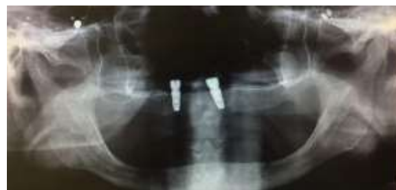
Fig. 2. Panoramic radiograph after implant insertion

Two implant fixtures (Implantium II, Dentium, Korea) with 10 mm length and 4 mm diameter were inserted in the superior portion of the moderately resorbed maxillary bone, and the patient was provided with detailed instructions regarding the hygienic care (Figure 2).