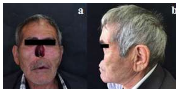
Fig. 1. Initial presentations. (a) frontal view, (b) lateral view

A 71-year-old man with total rhinectomy due to BCC was referred to the Department of Prosthodontics, Dental School of Tehran university of Medical Sciences. He had undergone radiotherapy at a dosage of 50 Gy for 25 sessions 1 year after his first excisional biopsy and 7 years before referring to our department. However, two years later, because of the recurrence with a diagnosis of infiltrative BCC (morphaea pattern) of the nose, the patient underwent complete rhinectomy. A split skin graft was placed at the base of the defect for lining of the surface of the area (Figure 1). Since he was edentulous, a complete denture was first made for him in order to provide optimal support for the upper lip before commencing the fabrication of nasal prosthesis.