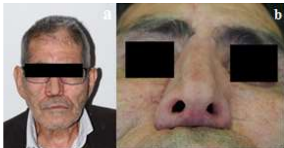
Fig. 5. Delivery of definitive implant-supported and bar-retained nasal prosthesis. (a) Frontal view. (b) Inferior view