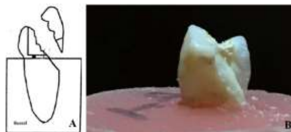
Fig. 3. Schematic (A) and actual (B) irreparable mode of failure

magnification to determine the failure mode as repairable or irreparable (Fig. 2 and 3).