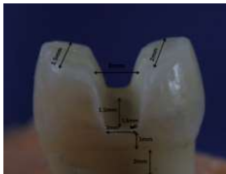
Fig. 1. Tooth preparation

Then, the composite was incrementally applied and cured for 20 seconds with an overlapping curing procedure in the pulp chamber as shown in Figure 1 [2,5].