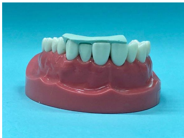
Fig. 1. Preparation of laminate veneer restoration

In this in-vitro experimental study, the sample size was calculated to be 10 in each group according to a previous study [22] assuming 90% study power. According to Alghazzawi et al [22], the maxillary left lateral incisor of a phantom received a laminate veneer preparation. Prior to preparation, an index was obtained from the tooth to standardize the thickness of laminate veneers to be fabricated. The preparation included 1.5 mm of incisal reduction and 0.5 mm of buccal reduction (Fig. 1).