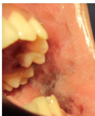
Fig. 1. White interlacing striae on the left buccal mucosa