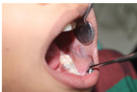
Fig. 4. Striae on the left buccal mucosa (case 2)