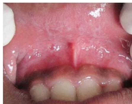
Fig. 2. Striae on the upper labial mucosa (case 1)

Almost 10 months after this, fluid-filled blisters appeared on both feet and ruptured after 2-3 days.