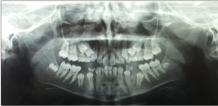
Fig. 1. Panoramic view of the patient

The prevalence of missing teeth excluding third molars varies in different areas with approximately 10.9% prevalence rate in the Iranian population [3]. Tooth germ may fail to develop or differentiate into dental tissues due to different factors. Genetics, radiation, trauma, inflammation and systemic disorders are considered the most common etiologic factors. Dental anomalies cause complications in mastication, speech and aesthetics, which may arise depending on the number of missing teeth [3]. Dens evagination (talon cusp in the anterior region) is an uncommon odontogenic anomaly comprising of a projection on tooth surface [4], which may cause malocclusion and aesthetic problems [5]. Although dens evagination may be found on the occlusal surface of posterior teeth, this anomaly is more commonly seen on the lingual surface of the maxillary lateral incisors (67%) followed by central incisors (24%) and canines (9%) [6]. The overall frequency of dens evagination has been reported to be 1-4% [1] and males are more affected than females [5]. Pulp stones are known as discrete intra-pulpal calcifications frequently found in molars [6-8]. Pulp calcifications vary in size ranging from tiny particles to huge masses that almost obliterate the pulp space [8]. Pulp stones have a clinical significance when root canal therapy is required.