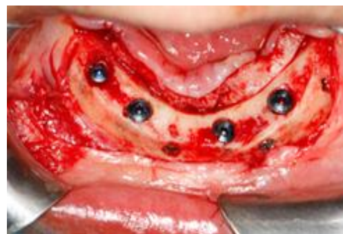
Fig. 5. Interval of holes from implants

The holes in the separated crestal segment were larger than the lingual ones to provide better adaptation and lag screw effect. The holes were placed at least 2 mm far from the implant insertion site (Fig. 5).