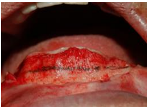
Fig. 2. Determining a 4 mm height of bone

After exposing the bone on the buccal side, a bone segment from tooth #21 to tooth #28 with a 4mm height in the midline was measured using a caliper (Fig. 2). The marked bone was cut as follows: