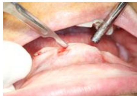
Fig. 1. A 2 mm incision buccalized from peak of crest in anterior region of mandible

Immediately before surgery, an oral nonsteroidal anti-inflammatory drug (NSAID; Ibuprofen 400 mg: Gelofen®, Dana Corp., Tabriz, Iran) was administered. We asked the patient to mouthwash with a 1.2% chlorhexidine solution for one minute. Local anesthesia was administered via a bilateral mental nerve block and local infiltration (lidocaine with 1:100,000 epinephrine, Xylopen®, Exir Co., Tehran, Iran). Afterward, a 2mm buccal incision was made using a No.15 surgical blade from the crest of the alveolar ridge in the anterior region of the mandible, extending from tooth #20 to tooth #29. The buccal subperiosteal flap was elevated. No releasing or elevated flap was made on the crest or the lingual side (Fig. 1).