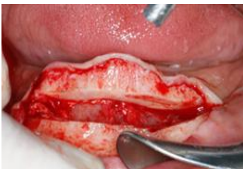
Fig. 3. The subperiosteal composite graft

Afterward, the two segments were inserted lingually and were leveled and adapted to the remaining bone in the anterior region. Then, holes were drilled on both lingual and buccal segments while the operator's fingers fastened the segments together.