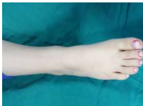
Fig. 1. Clubbing of the fingers due to pulmonary atresia along with ventricular septal defect

A 3.5-year-old female patient was admitted to the Dental Clinic of Mofid Children's Hospital, Tehran with a chief complaint of dental pain for evaluation and treatment. She had been earlier diagnosed with PA/VSD (Fig. 1).