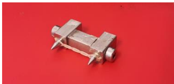
Fig 2. Designed holding-jig for retaining each of the chain segments

The chains were pre-stretched to 100% of their initial length for 10 seconds. A jig with two secured posts was designed (Figure 2), so that the distance between the posts would be fixed at 25mm to simulate the distance between the first molar hook and distal wings of the canine brackets [15]. Each piece of chain was stretched between the two posts. In this way, a constant force was exerted on the elastomeric chain during the test period.