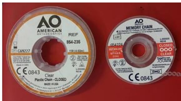
Fig.1. Closed elastomeric conventional (left) and memory (right) chains

Elastomeric chains were used to simulate the retraction of canines into premolar extraction spaces. Memory and conventional clear closed elastomeric chains (American Orthodontics (AO), USA) (Figure 1) and were stored in plastic bags at room temperature (22-24°C) until the beginning of the study [15]. Each chain segment included five loops and an extra half-loop at each end to compensate for the probable damage caused by pre-stretching.