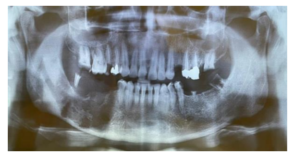
Fig 1. Panoramic view of the patient. The destructive lesion is seen at right mandibular region.

S100. The patient was referred to the Cancer Institute Hospital, Tehran, Iran for further evaluation. Imaging studies showed a destructive unilocular radiolucent lesion extending from the alveolar ridge to the inferior border of the mandibular body involving both buccal and lingual plates with perforation and soft tissue involvement. The lesion was in close proximity to the inferior alveolar nerve (Fig 1).