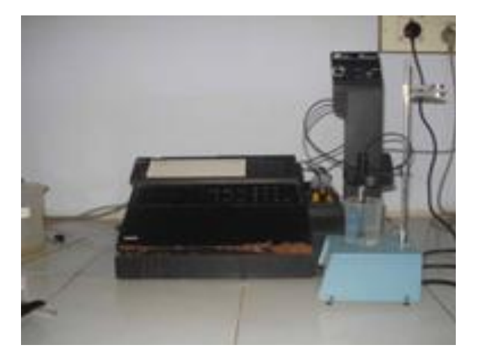
Fig 3. Fluoride ion selective electrode connected to an ion selective electrode meter

Fluoride release was highest on day 1 and there was a sudden fall on day 2 in all three groups. Fluoride release later increased up to day seven following which there was a gradual decrease (Fig 4).