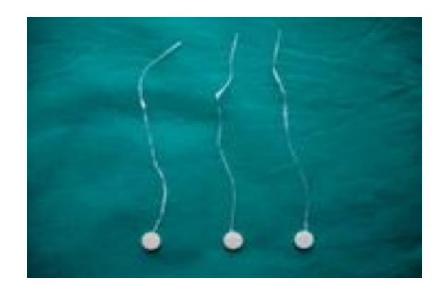
Fig 2. Dental floss incorporated into the tablets

This was then transferred to a plastic vial into which a magnetic stirrer was placed. The electrode was dipped into the solution and fluoride concentration was recorded in parts per million. (TISAB II) is used to decomplex the fluoride ion, to provide a constant background ionic strength and to hold the pH of water be-