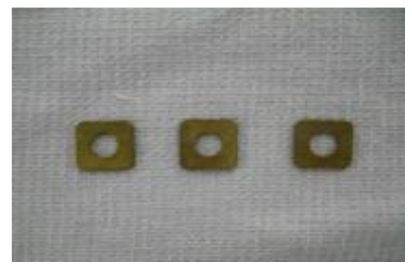
Fig1. Cylindrical brass moulds

Then the glass slide was removed and cured from below for 20 secs. The set discs were gently pushed out of the moulds.Each disc specimen was immersed in airtight polyethylene bottle containing 20ml of deionized water and incubated at 37°C and stored for 24 hours.