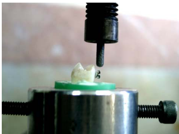
Fig.: Setup of the experiment; path of force application

machine (Instron Corp, model 8500, Canton, MA, USA) with a cylindrical cross-head diameter of 1.5 mm set at a speed of 5 mm/min, positioned perpendicular to the bracket (Fig 2) was used for the debonding procedure.