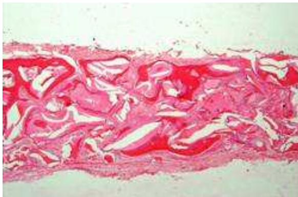
Fig1. Bio-Oss sample at 20×magnification