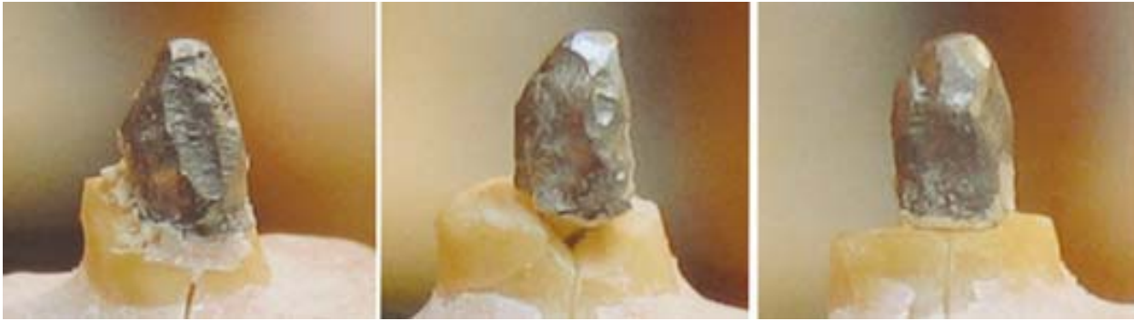
Fig. 3: Root fracture occurred in most specimens in group I.

treated teeth restored with four post-and-core systems: serrated, parallel-sided, cast post-and-core; prefabricated, stainless steel, serrated, parallel-sided post and resin-composite core; prefabricated carbon-fiber post and resin-composite core; and ceramic posts and resin-composite cores. They did not find a significant difference in fracture resistance between the teeth that were restored with these four post-and-core systems.