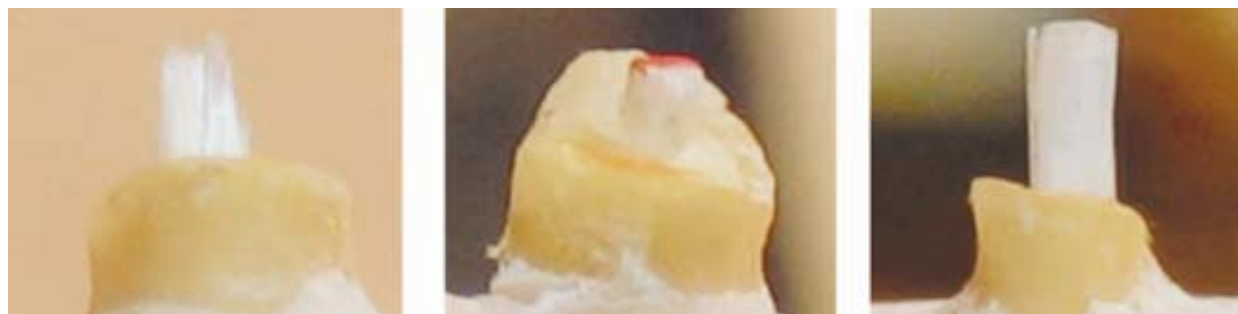
Fig. 2: Composite core fractured in group II and III in all specimens.

Hu et al [17] evaluated the fracture resistance and the mode of failure of endodontically