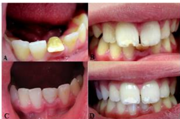
Fig. 1: Clinical photographs demonstrating (A, B) preoperative state of mandibular left central incisor with abnormal direction due to crown dilacerations: notice the yellowish color of the tooth, (C) postoperative appearance and (D) one-year follow-up

An 11-year-old girl was referred to our Department (Department of Endodontics, Faculty of Dentistry, Tehran University of Medical Sciences, Tehran, Iran) in June 2012. Her parents complained of “an abscess related to her lower anterior teeth developed one month ago and she took antibiotics for it”. She had no systemic problem. Dental history revealed a previous trauma to primary mandibular anterior teeth (teeth #71, 81) when she was three years old. Her primary central incisors were avulsed due to that trauma. Avulsed primary teeth had not been replanted. Clinical examination revealed a mandibular left central incisor (tooth #31) with moderate dilaceration of crown. The tooth had a labial angulation and the region of dilaceration was in the cervical part of the tooth. The crown showed yellowish discoloration, which was assumed to be due to enamel hypocalcification (Fig. 1a, 1b). The tooth had no caries. Vitality tests including cold test (Kalte Spray; Marcadent GmbH, Erkelenz, Germany), heat test (by a low-speed rubber cup) and electric pulp test (Coxo Dental Pulp Test C-Pulse; Soin Dental Co., West Byfleet, UK) were done.