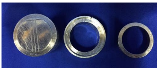
Fig. 1: The mold with three horizontal and two vertical grooves

Cavex Outline Light Body Impression Paste