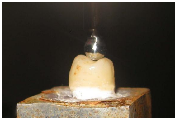
Fig. 3. Load application

The stone models were scanned (Cercon Eye Scanner, Cercon, DeguDent, Hanau, Germany) and used for the fabrication of zirconia-based core. A thickness of 30 microns was provided as cement spacer and the final crown was milled out of a semi-sintered block of zirconia (Cercon Base, Cercon, DeguDent, Hanau, Germany) using the scanned digital file as a guide. The patterns were 20-25% larger to compensate for the sintering shrinkage. The milled copings were sintered in a furnace (Cercon Heat, Cercon, DugoDent, Hanau, Germany) to 1450 °C for five hours. Each core coping was tried on the corresponding die (stone model) using disclosing material (Fit checker; GC America Inc., Alsip, IL, USA). Interferences were removed using a diamond bur (ISO 640.015; D+Z, Lemgo, Germany). A coping was discarded if it required adjustment for more than three times. The veneering porcelain was then applied (Cercon Ceramic Kiss, Cercon, DeguDent, Hanau, Germany) after inserting one layer of liner and fired at 970°C. The dentine porcelain was applied and fired at 830°C, followed by an enamel layer, which was fired at 820°C. Final morphology was verified using the putty templates. All crowns were glazed at 800°C. Marginal adaptation was assessed by measuring the gap between the crown margin and the external surface of the preparation, known as the absolute marginal opening [27,28], before cementation. Three points, in the middle and