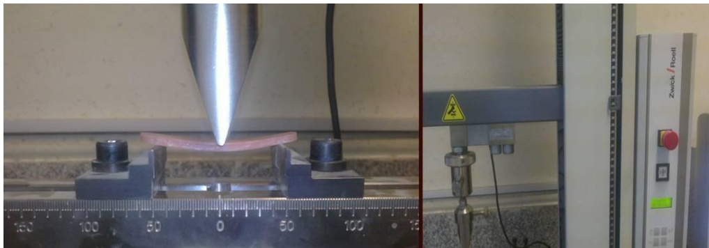
Fig. 2. Universal testing machine for flexural strength testing

Flexural strength ( S ) = 3PL/2bd^2 L: length, b: width of specimens, d: thickness of specimens, P: the load at fracture (N)