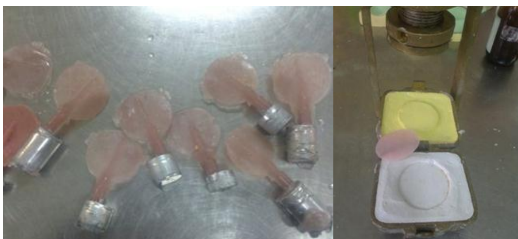
Fig. 4. Samples made of Meliodent conventional acrylic resin and Bre.Crystal thermoplastic acrylic resin for water sorption testing.

The diameter of the samples was calculated from the mean values of three different points. The mean thickness was measured using the thickness at four equidistant points on the circumference and the thickness at the center of the sample (total of five points).